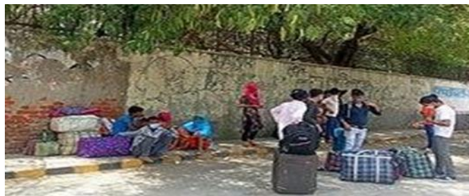
Photo: Stranded migrant workers during fourth phase of the lockdown near Delhi

These migrant workers were mainly stuck in Delhi and Mumbai and major migrant workers belonged from UP, Rajasthan, Jharkhand, Bihar and Orissa.