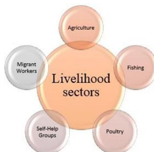
Figure 2 Different sectors being affected by the Pandemic Agriculture:

Following the verification of the stationary status of the data, the analysis used VAR lag order selection to determine the optimal lag duration. According to the results illustrated in table 3, the optimum lag period in this analysis was determined to be three lags based on AIC, SC and HQ.