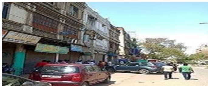
Photo: Migrant worker stand in a queue for food at delhi govt school